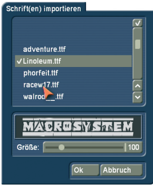
Import TrueType fonts