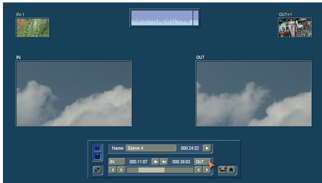
Easy to use: Trimming video scenes