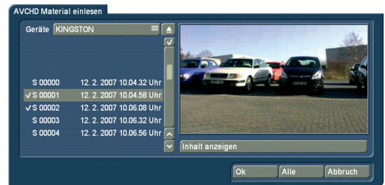
Import AVCHD footage